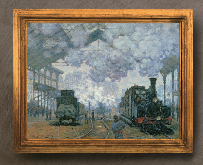
Game Changing Creativity