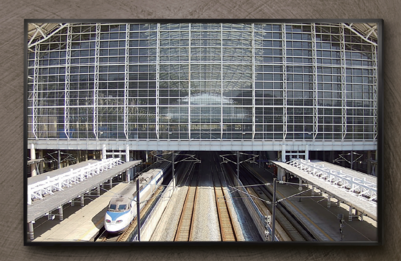
Game Changing Clarity

IDIS images are from 4K video footage and may be slightly distorted.